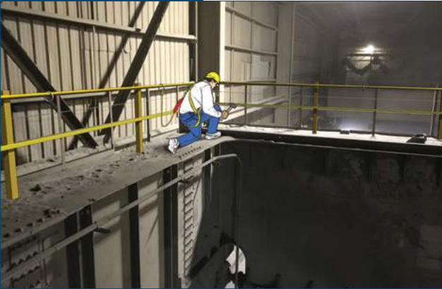
Conceptual design of a fall protection solution for bridge crane and end trucks.

provide appropriate safety for workers within the extreme environment of the meltshop. Considering the unique conditions, it did not appear any manufactured systems or equipment would adequately protect the workers. Exploring effective, customized options would require a combined knowledge and experience in both structural engineering and fall protection safety regulations and standards.