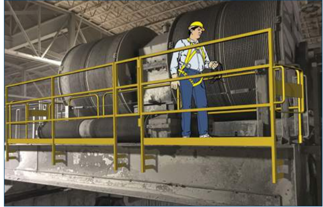
Conceptual fall protection solution for trolley maintenance.