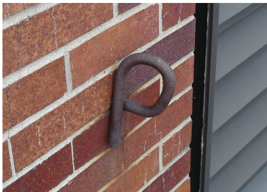
Clockwise from top left:

Photo 1: Using a flexible anchorage connector will help prevent unwanted loading of a snap hook.