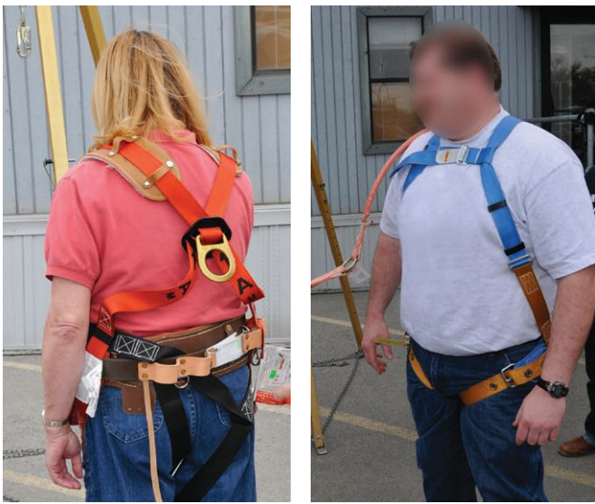
Photos 8 and 9: Improper harness fit. Photo 8 (left) shows the harness dorsal D-ring more than halfway down the person's back, while it should be between the shoulder blades. Photo 9 (right) shows a chest strap positioned too high, which could cause a choking hazard in the event of fall.

that the competent person annual equipment inspection includes reviewing product inventory against product recalls.